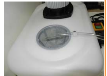
Recycling Water Pipe Holder