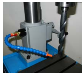
Magnetic Holder of Universal Bending Pipe (able to stick to any metal surface) + Adjustable Water Valve