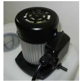
Cooling Fan+ Overheat Prevention Device