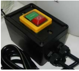
IP54 Switch of Dust-Proof and Water-Proof and Switch Box