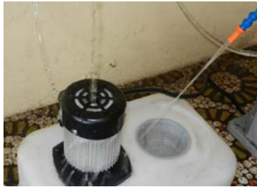
IP54 Dust-Proof and Water-Proof