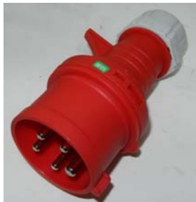
Single-Phase Plug or Three-Phase Industrial Plug(OPTIONAL)