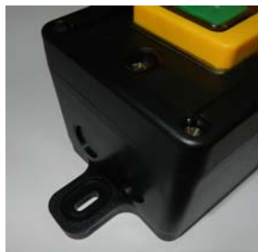
Switch Box Holder